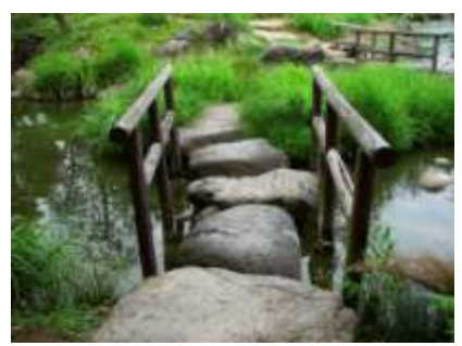
Stepping Stones Author Unknown

Come, take my hand, the road is long We must travel by stepping-stones. No, you're not alone; I'll go with you. I know the road well; I've been there. Don't fear the darkness, I'll be with you. We must take one step at a time. But remember, we may have to stop awhile, It is a long way to the other side, And there are many obstacles. We have many stones to cross; some are bigger than others.