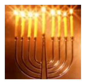
The Mourner's Prayer (Excerpt From The Kaddish – The Jewish Tradition)

At the rising of the sun & at its going down; We remember them.