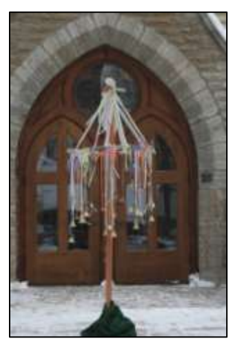
The IRIS Holiday Service of Remembrance We hope you will be able to join us Sunday December 4, 2011

Tiny hands and feet, Perfect face soft and sweet. Cradles of clouds rocking gently, Angels keeping silent sentry. Watching over with a loving sense, Babes of beauty and innocence. What a wonderful place heaven must be, So many babies to love and see. Those special moments we shared on earth, Memories forever alive from your birth. No child who lived until old age, Could be more loved or precious at any stage. Poppa, cuddle our babies and hold them tight, We love them and cherish them with all our might. Help them feel this love we send Til we join you in heaven and all sorrows will mend.