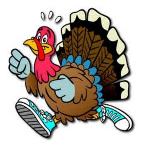
TURKEY TROT WEBSITE REGISTRATION IS OPEN

IRIS received a $2,500 donation from Gopher Sport in Owatonna in March 2014. Turkey Trot planning began early this year in the hope of allowing more people to volunteer and participate. Generous donations continue to come in to our office!