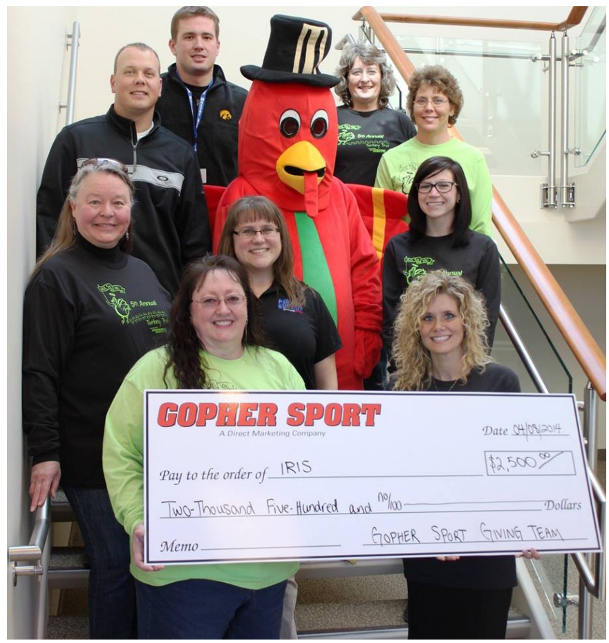
Pictured above are employees from Gopher Sport along with IRIS staff and Turkey Trot volunteers.

Coming soon....the 6th Annual IRIS Turkey Trot! We hope you plan to join us on Thanksgiving morning, November 27, 2014. You can run, walk, trot or jog, bring the kids and bring your dog! We will have prizes for the top runner in each age category, and treats for all participants at the end of the race.