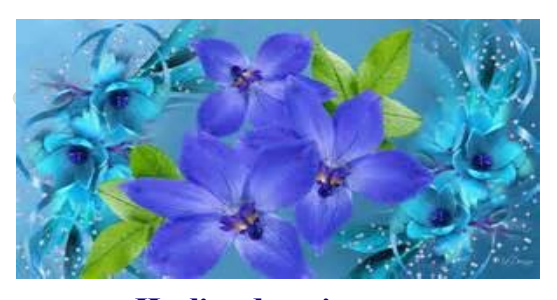
Healing doesn't mean The damage never existed, It means the damage No longer controls our lives.

your kisses still linger, and your whispers softly echo. It's the place where a part of you will forever be a part of me."