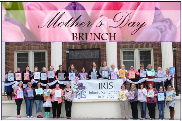
Participants with their Gallery on the Go, dragonfly paintings

We at IRIS would like to add that Vacationing during the Holidays does add to the stress and expectations others may have for you. Be clear in your explanation of your reasons to travel during the holidays and expectations for yourselves. You can not run from grief, you are already out of your comfort zone, try not to upset everyone by "running from the holidays". Have an honest conversation, explain why you will be gone, and when you will return.